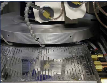
Facing a vacuum chuck